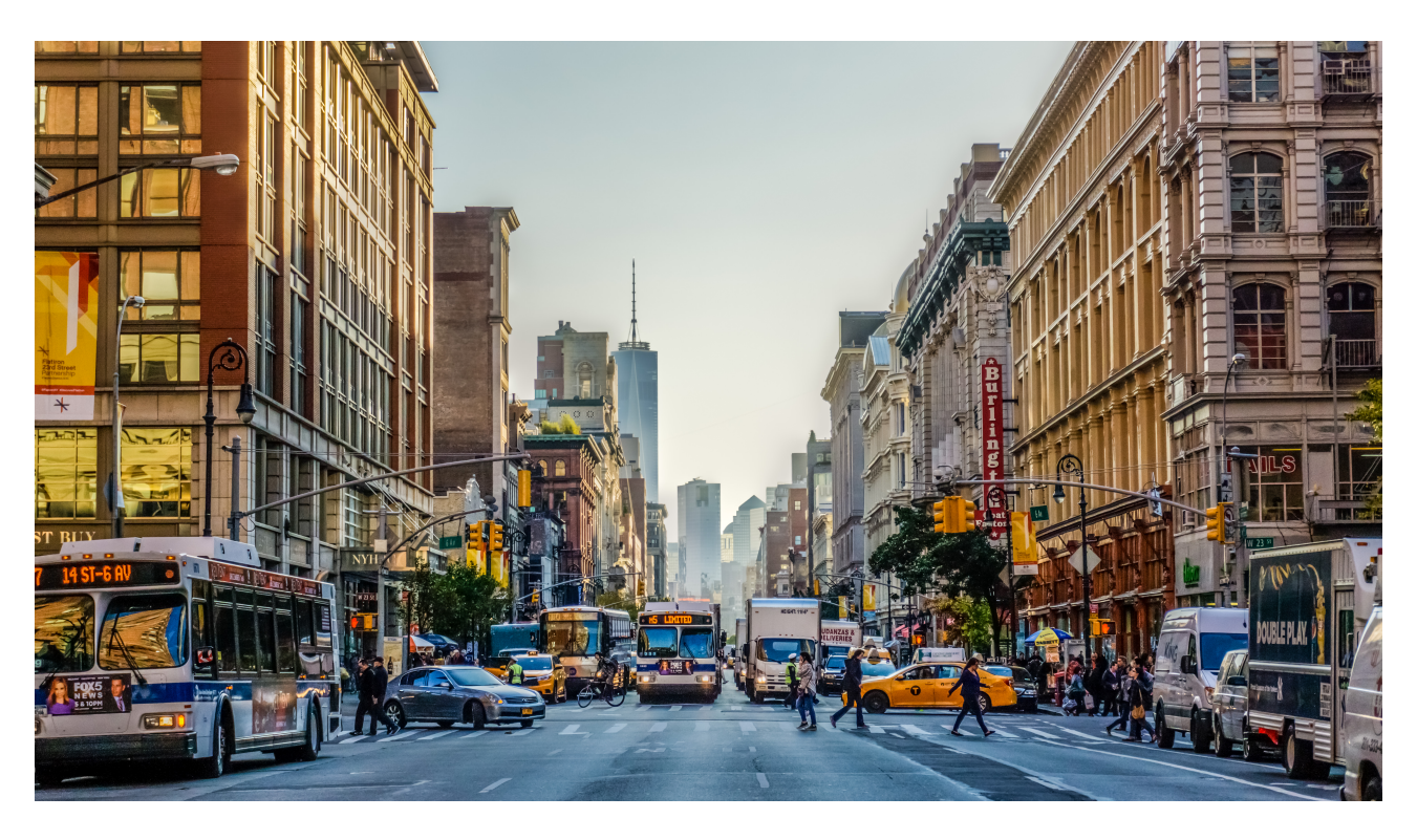
Street scenes will change significantly with the introduction of autonomous vehicles

Flying vehicles are out of scope for this report. (Although Uber is working on city based flying vehicles, see Uber Elevate - www.uber.com/elevate)