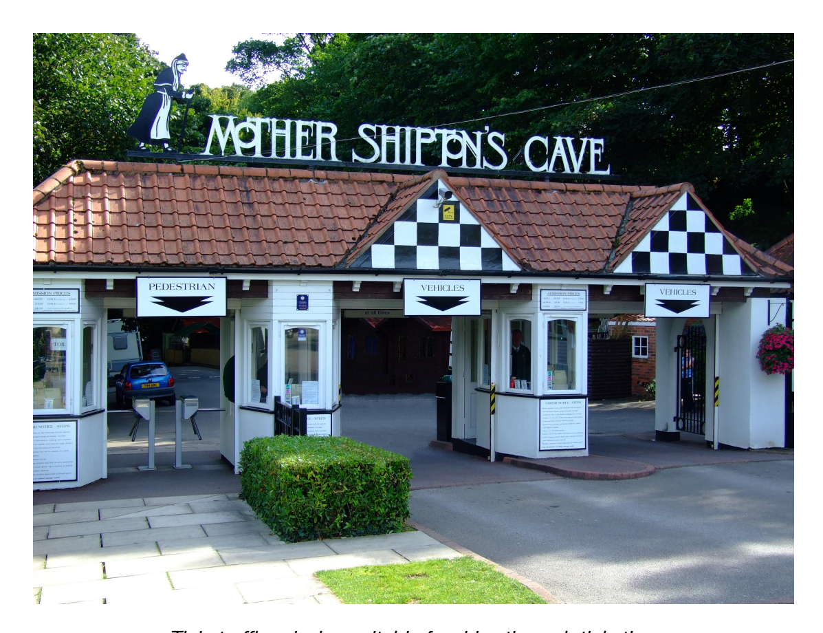
Ticket office design suitable for drive through ticketing

If you don't yet have tickets, the car could buy them while driving towards the attraction, again making the entrance experience seamless.